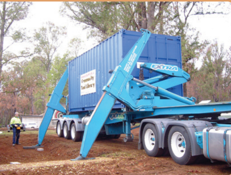
The Peet-sponsored Tool Library ready to be delivered to Traralgon for use by community members in the area.